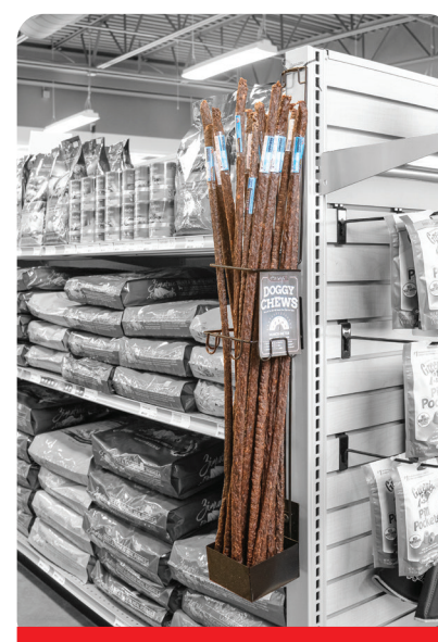
Strategically place chews throughout store for incremental sales

Understanding how your customers move through your store can unlock incremental sales