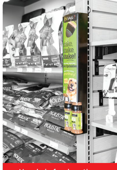
Upsale in food section – consider a topper to spice up food!